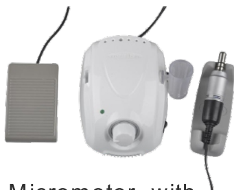
Micromotor with Straight Handpiece

Welch Allyn Pocket LED Oscope - Lightest-weight Welch Allyn Ophthalmoscope and Oscope for portability and ease of use - The fiber optics on Pocket LED Oscopes provide cool light with no reflections or obstructions - Pocket Plus LED Oscopes come with up to 6 lumens for 2X the light intensity and a 5-year warranty - soft rubber brow rest, for enhanced comfort during an exam, and a 5-year warranty