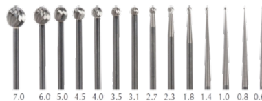
-Cutting Burs (SS & TC) -Diamond Burs -Conical Burs